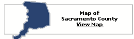
Map of Sacramento County View Map